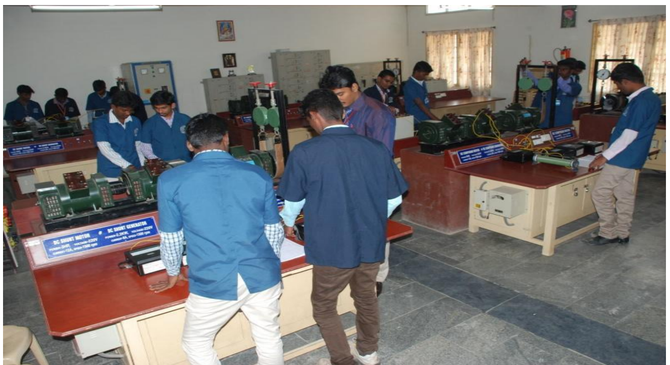
Electrical Machines Lab